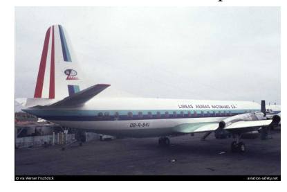
The Doomed Electra

December 24, 1971 – A LANSA (Lineas Aerèas Nacionales, S.A.) Lockheed L-188 Electra flying from Lima, Peru to Pucallpa is struck by lightning, catches fire and breaks apart in mid-air.