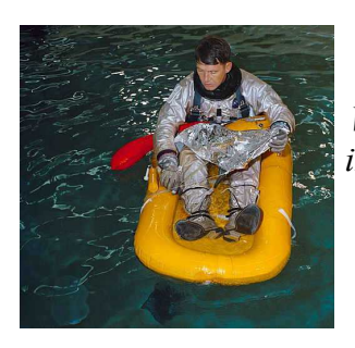
Wally Schirra practicing in a one-man life raft.Not quite a Carnival cruise ship.