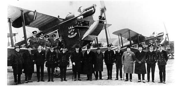
Instone Crew, officials and de Havilland DH-18s

January 1, 1922 – The first airline uniforms are introduced by Instone Air Lines. Instone was one of the first British airlines and operated from 1919 to 1924 when it was absorbed into Imperial Airways.