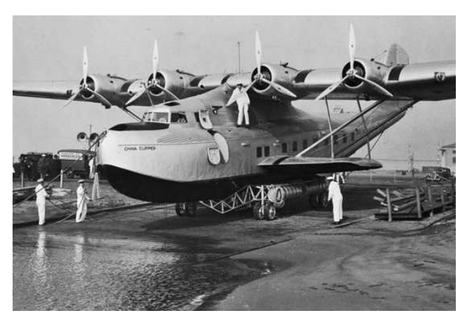
China Clipper on its beaching gear.

December 30, 1934 - First flight of the Martin M-130 flying boat.