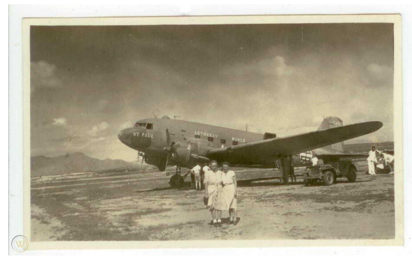
Central Air Transport C-47

Tommy Wing had a three man crew and seven passengers. Wing, Chinese, was a U.S. citizen who had been born in Chicago. Wing was directed to Kiangwan but had never used GCA and had to fly a missed approach. The C-47 struck the roof of a building in crashed. Three people on the ground were also killed.