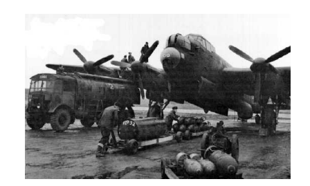
Lancs "bombing up" and Mossies on their way to target.

equipped with Oboe, a target locating device utilizing two ground radars and an aircraft mounted transponder led eight No.8 Group Lancasters to Düsseldorf.