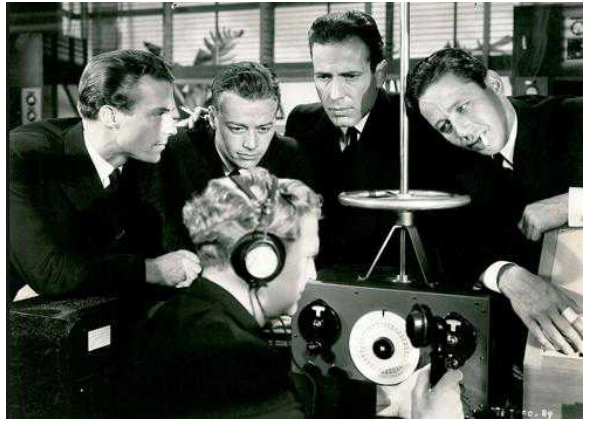
"China Clipper calling Alameda. China Clipper calling Alameda. China Clipper calling...."" For the film trailer, Go to: https://www.imdb.com/title/tt0027445/

27 DEC-No Meeting 03 JAN-TRCS Staff Meeting-Cadet CoC 10 JAN-TRCS Commander's Call 17 JAN-TRCS Meeting 24 JAN-TRCS Meeting 31 JAN-TRCS Meeting