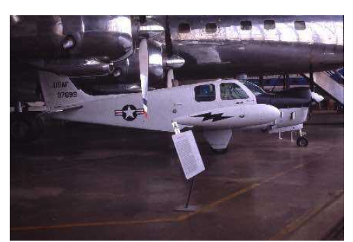
Note the bulged nose fairing needed to allow for installation of the heavy duty alternator required to run the electronics.

Designed as a drone used for electronic monitoring and signal relays during the Vietnam unpleasantness. The propeller used a reduction gearing system to reduce noise and give it semistealth characteristics as it flew night missions along the Ho Chi Minh Trail. However, equipment reliability issues meant that the missions were flown by a pilot.