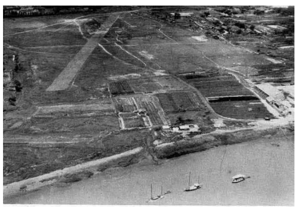
ina National Aviation Corporation Airport at Lung-hwa, near from the Air.

December 25, 1946 - Chinese aviation "Black Christmas." Three our airliners crash while trying to land at Shanghai's Lungwha Airport. Rather than burning off, the usual morning fog thickened, ceiling was below 100 feet and visibility was 50 to 100 feet. Under the best of circumstances the grass and gravel airport was hard to find with only a single light at each end of the runway and a nondirectional homing beacon.