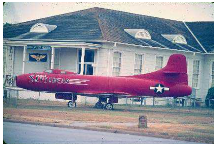
Number 1 D-558-1 as originally displayed at the NAS Pensacola Museum.

June 10, 1953 – Scott Crossfield flew the Douglas D-558-1 Skystreak on its last flight. Three were built for high speed research and used to explore the near transonic range.