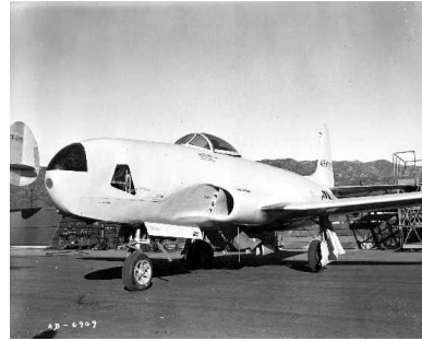
A P-80A converted to an F-14. Note the camera window.

The F-6 (RF-51/Mustang), F-13 (RB-29A/Superfortress), F-14 (RF-80/Shooting Star) and F-15 Reporter (RF-61/Black Widow) were all operational during the designation change.