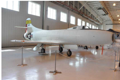
Number 3 Skystreak at the Carolina Aviation Museum in Charlotte, N.C.

June 11, 1948 – Air Force Regulation 65-60 is published which changes the designations for many Air Force aircraft types. Fighters will now have the prefix “F” instead of “P” for pursuit, reconnaissance aircraft will now be designated “R” instead of “F” for photographic and helicopters will now be designated “H” instead of “R” for rotary wing.