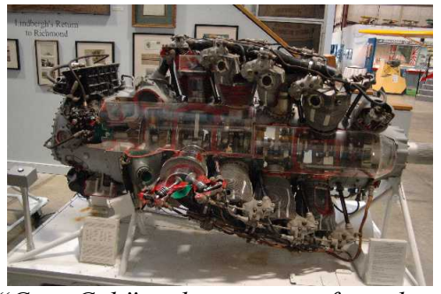
The "Corn Cob" nickname came from the slight twist applied to the banks of cylinders which allowed a better flow of cooling air.

The 4,300 hp 28 cylinder "corn cob" engine was the height of development of the very large radial In issue 17.30, an historical reference about Col engines but it did not reach operational service