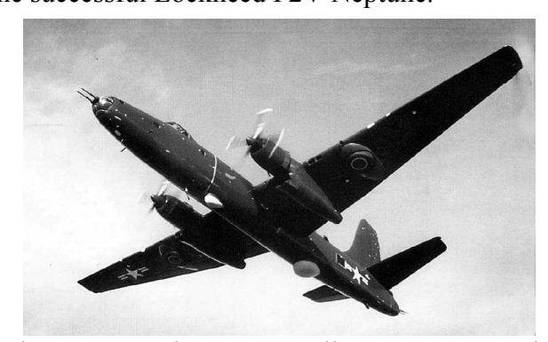
The P4M-1Q electronic intelligence variant. The aircraft has four engines, two P&W Wasp Major piston engines and two Allison J-33 turbojets in the aft end of the engine nacelles.

Sept. 20, 1946 – First flight of the Martin P4M Mercator which competed unsuccessfully for the role of a long-range maritime patrol aircraft with the successful Lockheed P2V Neptune.